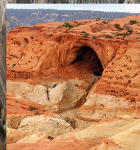
The trail to Cassidy Arch crosses colorful sandstone landscapes.